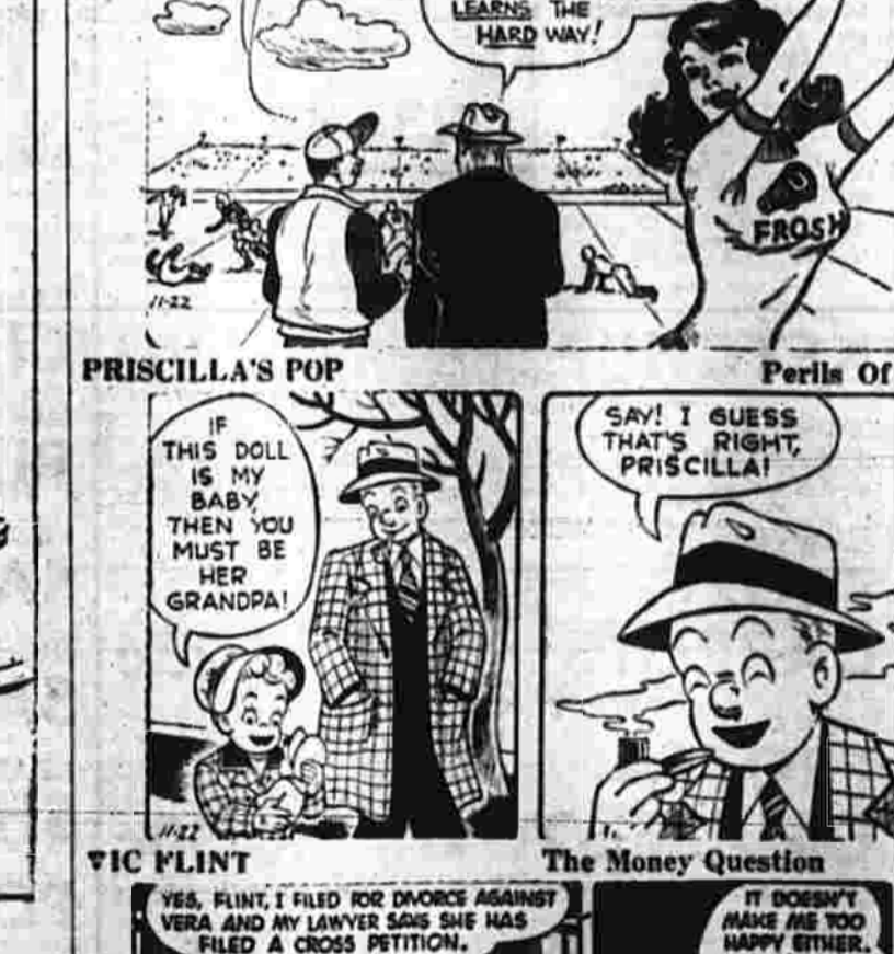
PRECKLES AND HIS FRIENDS