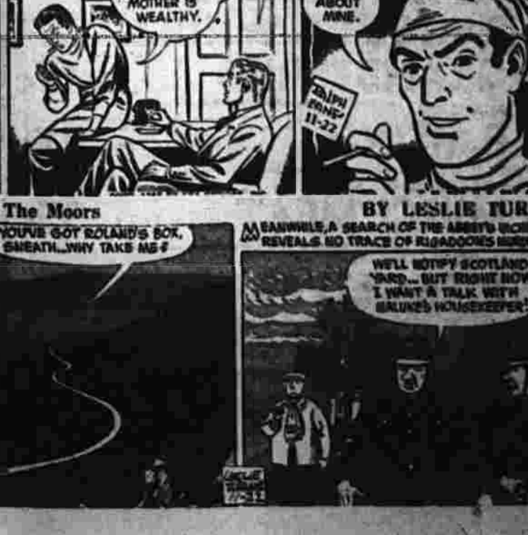
THE MONEY QUESTION

Remember last August when we were complaining about the heat and drought and not a breath of air stirring?