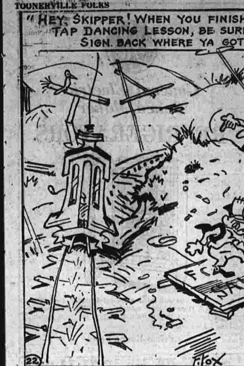
HEY SKIPPER! WHEN YOU FINISH GIVING THAT TAP DANCING LESSON, BE SURE TO PUT MY SIGN BACK WHERE YA GOT IT!

House for Sale 72. NEW FOUR-room single with two full baths. Modern. Just off bus line. Immediate occupancy. T. J. Crockett, Broker, Phone 5416.