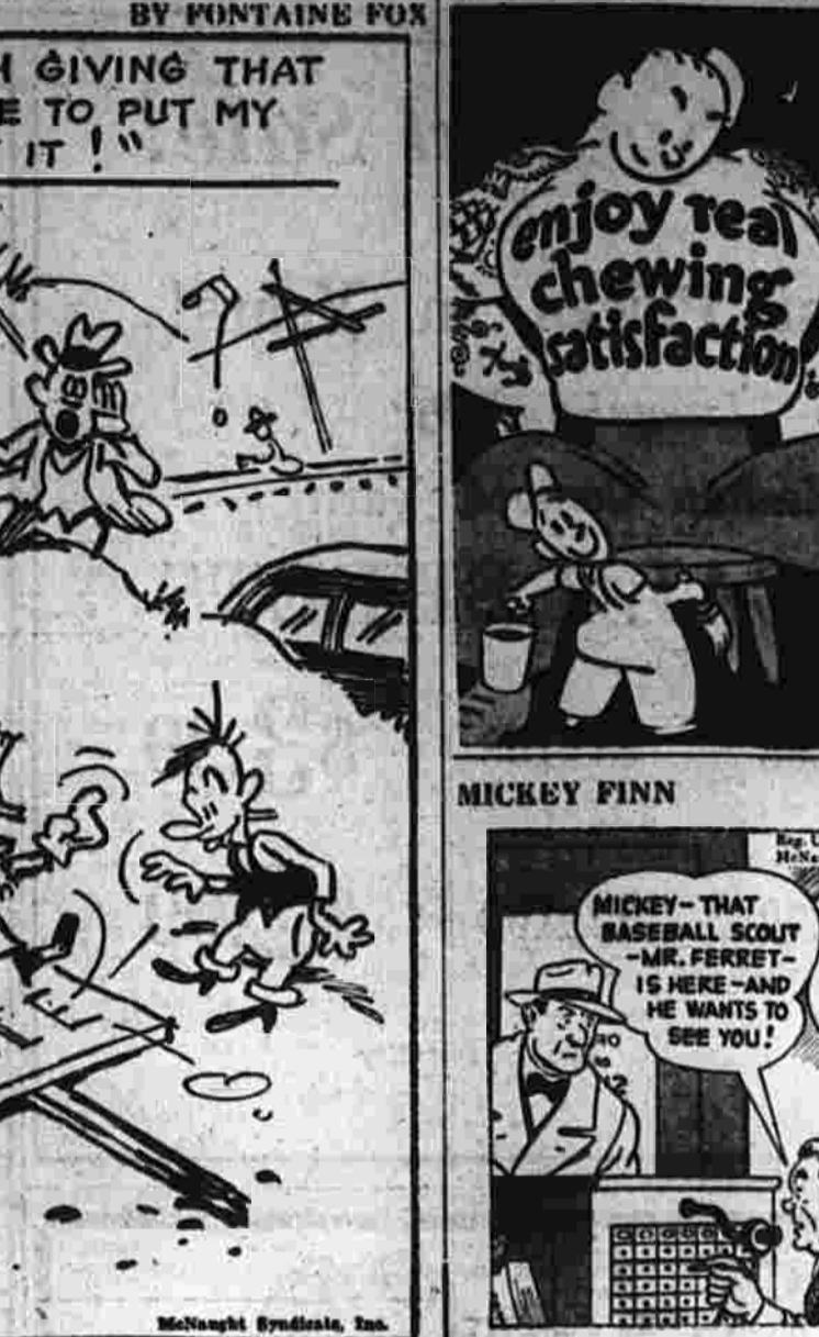
enjoy tea chewing satisfaction