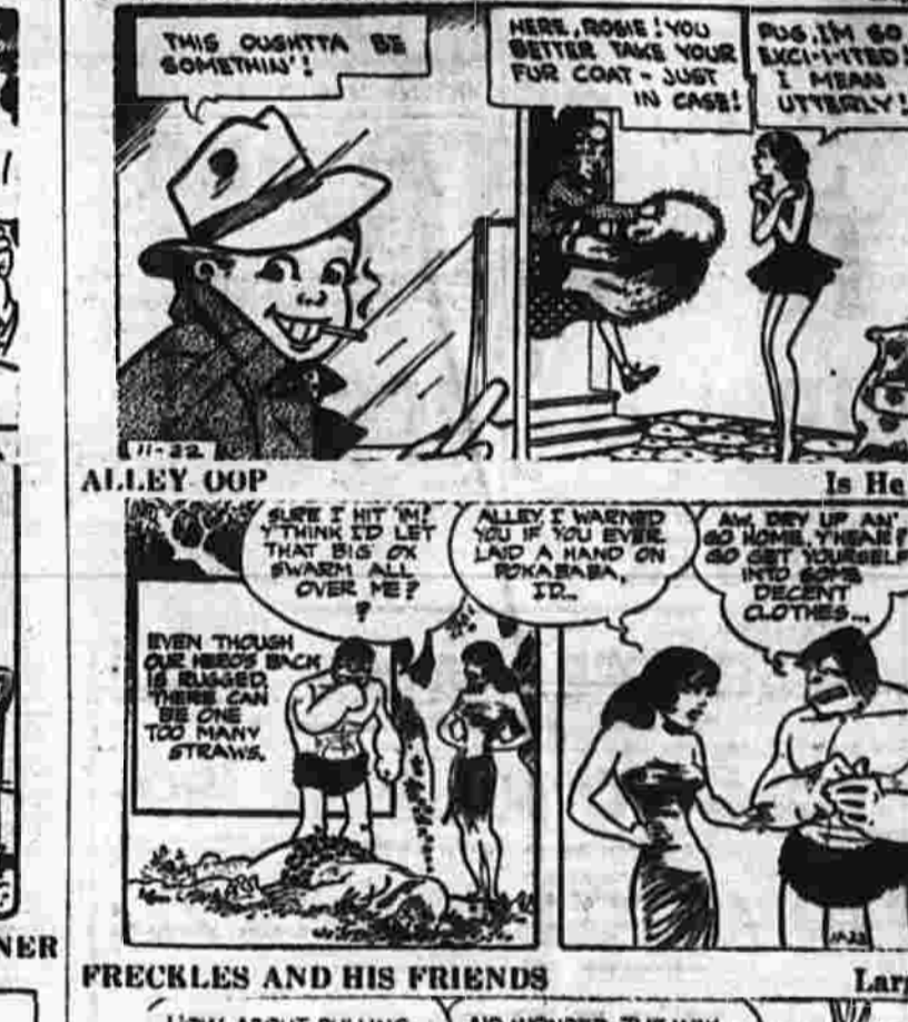
BOOTS AND HER BUDDIES